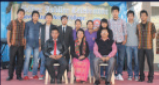
Dept. of Political Science