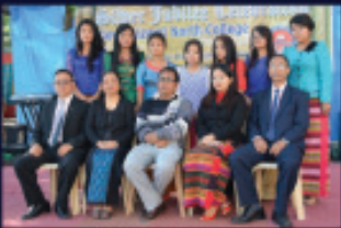
Dept. of Mizo