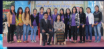
Dept. of Education