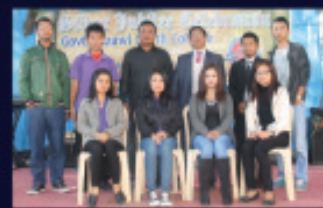
Dept. of History