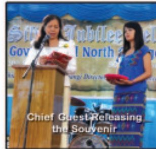
Chief Guest Releasing the Souvenir