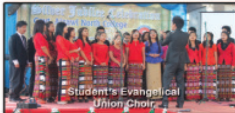
Student's Evangelical Union Choir