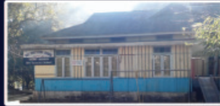
The Second College Building - Teachers' Training Institute, DIET