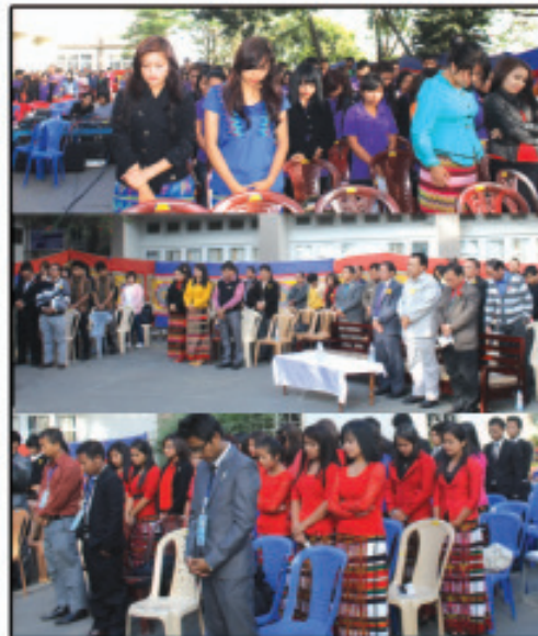
One minute silence in memory of departed colleagues