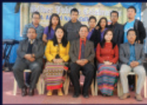
Dept. of Economics