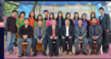
Dept. of Mizo