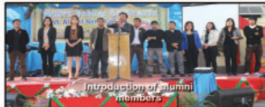
Introduction of alumni members