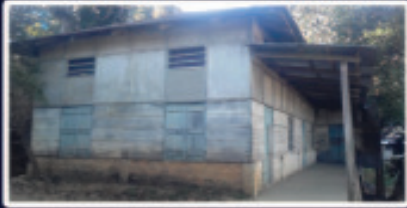
The School Building Where It All Began- Hrangchhuana High School, Ramhlun