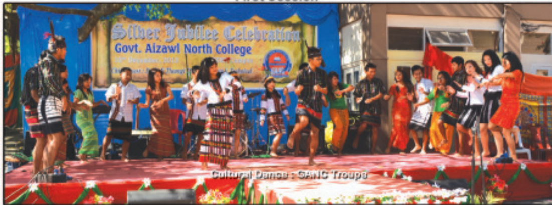
Cultural Dance - GANC Troupe