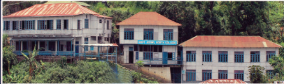
The Present College Building