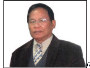
Former Chairman & President, Governing Body, Aizawl North College

“Millions saw the apple fall but, Newton asked why.”