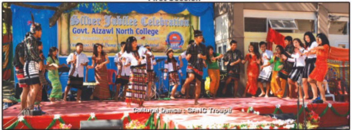
Cultural Dance - GANC Troupe