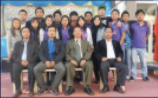
Dept. of Geography