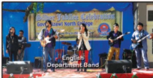
English Department Band