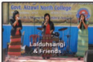
Laiduhsangl & Friends