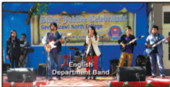
English Department Band