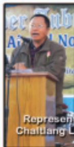
Representatives from Chaltiang Local Council