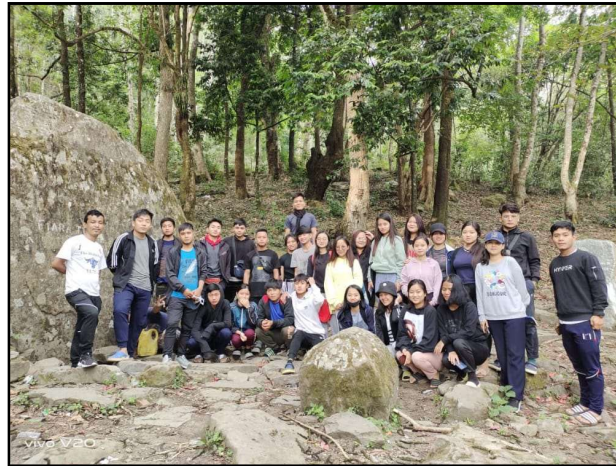
FIARA TUI, VAPHAH

Fiara tui was located in two palces Vaphai and Farkawn. It was a small spring tricking out from under a rock. When we visited Fiara tui of 19 th April, 2022, the located in Farkawn was dry out. So, we thought that the one located in Vaphai was the real one since were told that it was a pernnial spring.