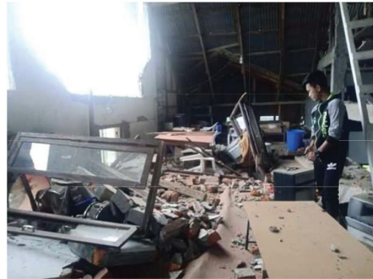
Fig. 4. Damaged place of worship