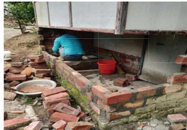
Fig. 2. Damaged sewer and pipe fittings