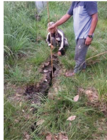
Fig. 6. Surficial cracks in Vaphai

tions were immediately damaged. The nature of the damage include cracked walls, cracked pillars, collapsed roofs Fig. 1 and walls were common. Sewer and pipe fittings were broken in many areas (Fig. 2) including destruction of masonry structures. Community halls (Fig. 3), buildings and places of worship (Fig. 4) were not spared too, 23 of such community assets were damaged and were verified throughout Champhai district. 6 schools and 8 government institutions and a Police Outpost at Zokhawthar were damaged along with their office materials. Few livestock including piglets and pets were also lost due to this seismic event. Damaged roofs and houses were common especially in Vaphai village (Fig. 5). Cracks on the ground were observed in many villages (Fig. 6).