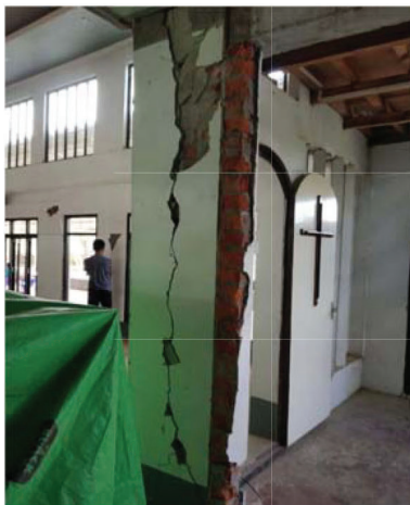
Fig. 5. Damaged residential house