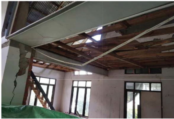
Fig. 3. Damaged community hall