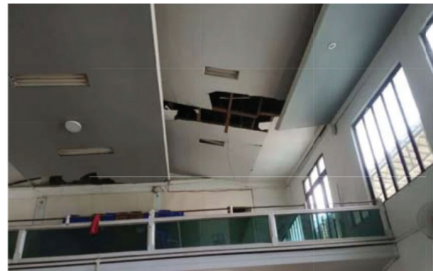
Fig. 1. Collapsed roof

The National Centre for Seismology (NCS, Gov't of India) reported a shallow depth of 20km for the earthquake. This indicates that the Vaphai earthquake occurred within the wedge and was not an intraslab Indian plate earthquake type, which typically occurs at depths more than 30 km. From focal mechanisms, strike-slip motions were observed on the steep planes which supported either dextral or sinistral motions which resemble that of the Mat fault but was not and the event was not associated with any fault from Mizoram. However, the immediate damages caused by this seismic event was disastrous and in some places of the district, the maximum intensity of VIII of the Medvedev-Sponheuer-Karnik (MSK intensity of damage scale) was assigned in certain places. Villages from the Champhai RD Block and the Khawbung RD Block were the most affected regions from the seismic event within Champhai district. A total of 92 dwelling houses which are made of single and double storeyed buildings, mostly of Assam Type and RCC construc-