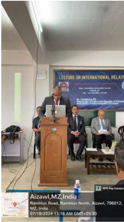
Aizawl, MZ, India Ramhlun Road, Ramhlun North, Aizawl, 796012, MZ, India 07/18/2024 11:18 AM GMT+05:30