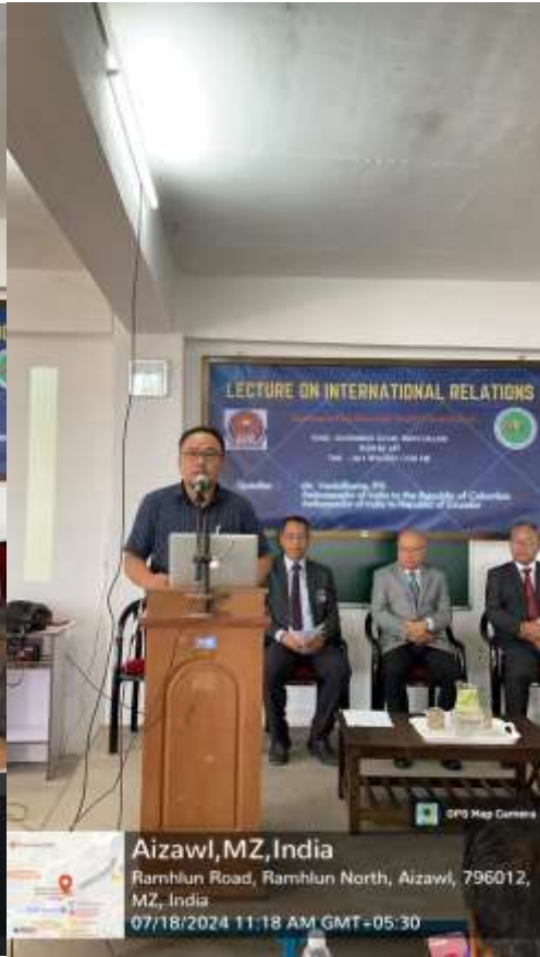
Aizawl, MZ, India Ramhlun Road, Ramhlun North, Aizawl, 796012, MZ, India 07/18/2024 11:18 AM GMT+05:30