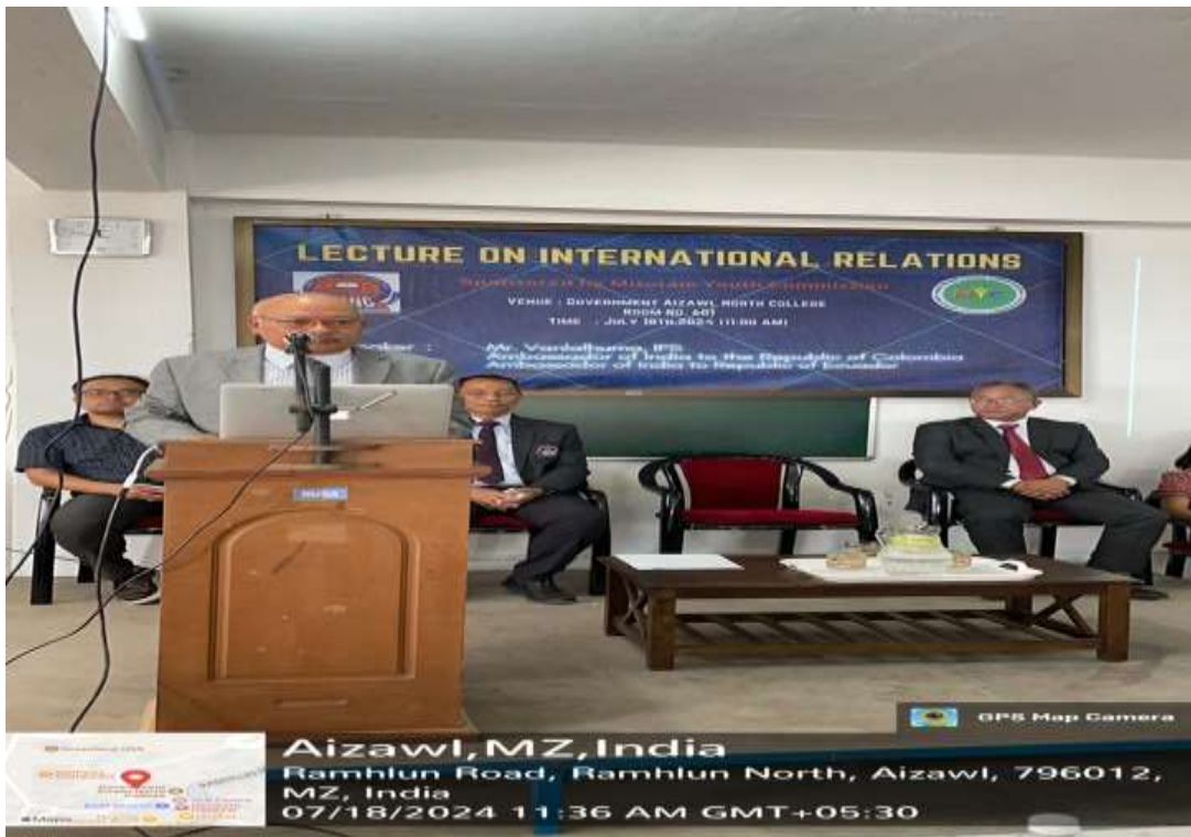
Aizawl, MZ, India Ramhlun Road, Ramhlun North, Aizawl, 796012, MZ, India 07/18/2024 11:36 AM GMT+05:30